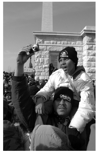
Over 2,000,000 gathered to view President Obama's Inauguration.

When it was over, the simultaneous departure of the enormous crowd could have been quite dangerous in the absence of any crush barriers, but people treated each other with respect. There reportedly was not a single arrest among spectators that day. The tone of the crowd was admittedly quieter than when it arrived, partly due to the brisk north wind blowing straight at us, and maybe due to the realization that once the celebration was over the hard slog