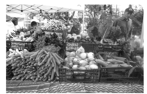
A variety of produce and other goods are waiting for customers at the Friday Market.

Sandy Schmidt, who manages the Friday Market for the Port Ludlow Village Council (PLVC), reports the market will open on Friday, May 8 , the Friday before Mother's Day. The Hood Canal Bridge will be