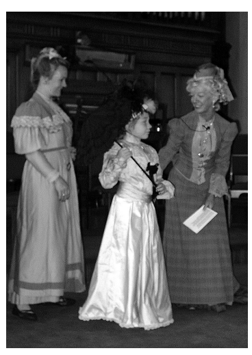
Victorian ladies model vintage attire.

Two Victorian theme fashion shows will be presented on Saturday, March 21, at 1:00 and 3:00 p.m., during the 13th annual Port Townsend Victorian Festival. Ladies, gentlemen and students from throughout Jefferson County will model beautiful Victorian costumes and exquisite vintage period attire from private collections. This scholarship fundraiser will be held at the First Presbyterian Church, 1111 Franklin Street, in