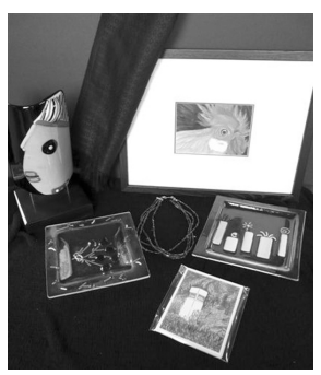
Auction will include artwork from local artists.

This is a wonderful opportunity to pick up artwork and art-related items by local artists and at the same time help collegebound Chimacum High School students.