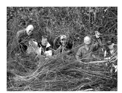
Hardy souls hack through the Ludlow Cove Trail.