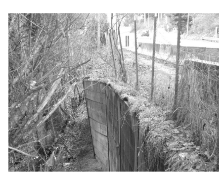
View of the challenged retaining wall with Oak Bay Road at upper right.

Monte Reinders, County Engineer, recently explained the geotechnical work at Oak Bay Road near the four-way intersection with Paradise Bay Road. He said that a soldier pile retaining wall at this location was failing. The failure caused the piles to