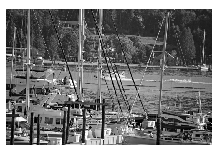
With the Hood Canal Bridge closure starting May 1, increased sea plane landings are expected at Port Ludlow Marina

In all, PLA is in excellent financial health according to Verrue. He predicts a bright future for Port Ludlow.