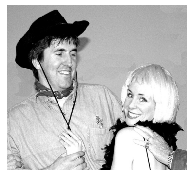
Where was her innocence lost?

Imagine a beautiful young woman whose innocence has been left somewhere in the past, and a brash young rodeo champion, stranded in a bus stop diner during a raging snowstorm. But they aren't alone. Keeping them company are a motherly, hardworking diner-owner,